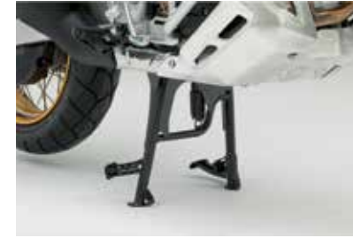
MAIN STAND 08M70-MKS-E01

This quick shifter enables quick up and downshifts without any clutch operation, thereby reducing the rider burden for long-distance adventure touring. Has AUTO-BLIP function enabling smooth and instantaneous shift decreases. (For Manual Transmission version only).