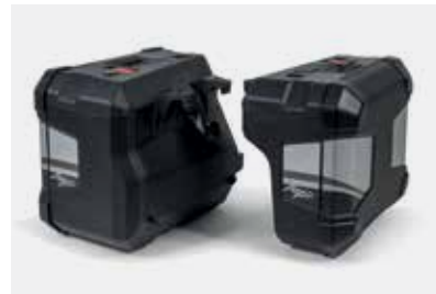
PLASTIC PANNIERS STICKERS 08ZAR-LOD-002GPAN

Possibility to order the 58L top box with stickers already fitted, as shown in picture (Part number: 08MHF-LOD-001GTOP)