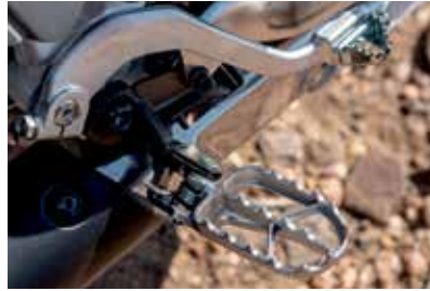
RALLY STEPS SET 08R79-MKS-E00

With their aggressive spike shape and a surface 57% larger than the standard ones, these Rally Steps improve the control during off-road riding.