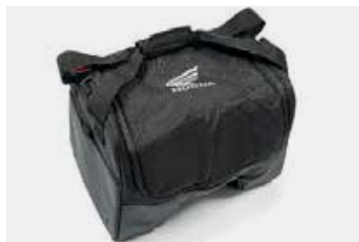
INNER BAG FOR 38-L TOP BOX 08L75-MJP-G51

Black nylon bag with embroidered silver Honda wing logo on the top and red zippers. Comes with adjustable shoulder belt and carrying handle.