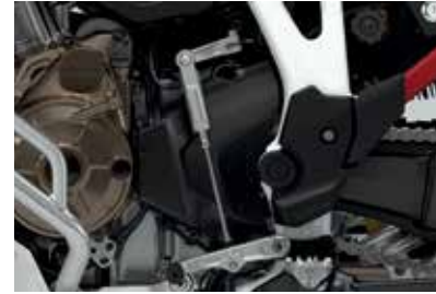
QUICK SHIFTER 08U70-MLG-E00

This kit enables the rider to change gear in the traditional 1 down – 5 up format by using the left foot. It works alongside the handlebar shift triggers giving the rider the choice of using either of them at any moment. (For DCT Version only)