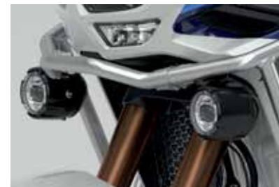
FRONT LED FOG LIGHTS KIT