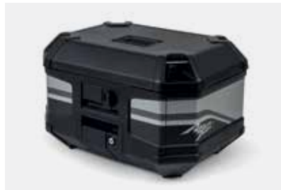
58L TOP BOX STICKERS 08ZAR-LOD-001GTOP

The Main Stand allows secure parking on a variety of ground surfaces and assists with maintenance operations.