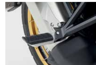
COMFORT PILLION STEPS SET