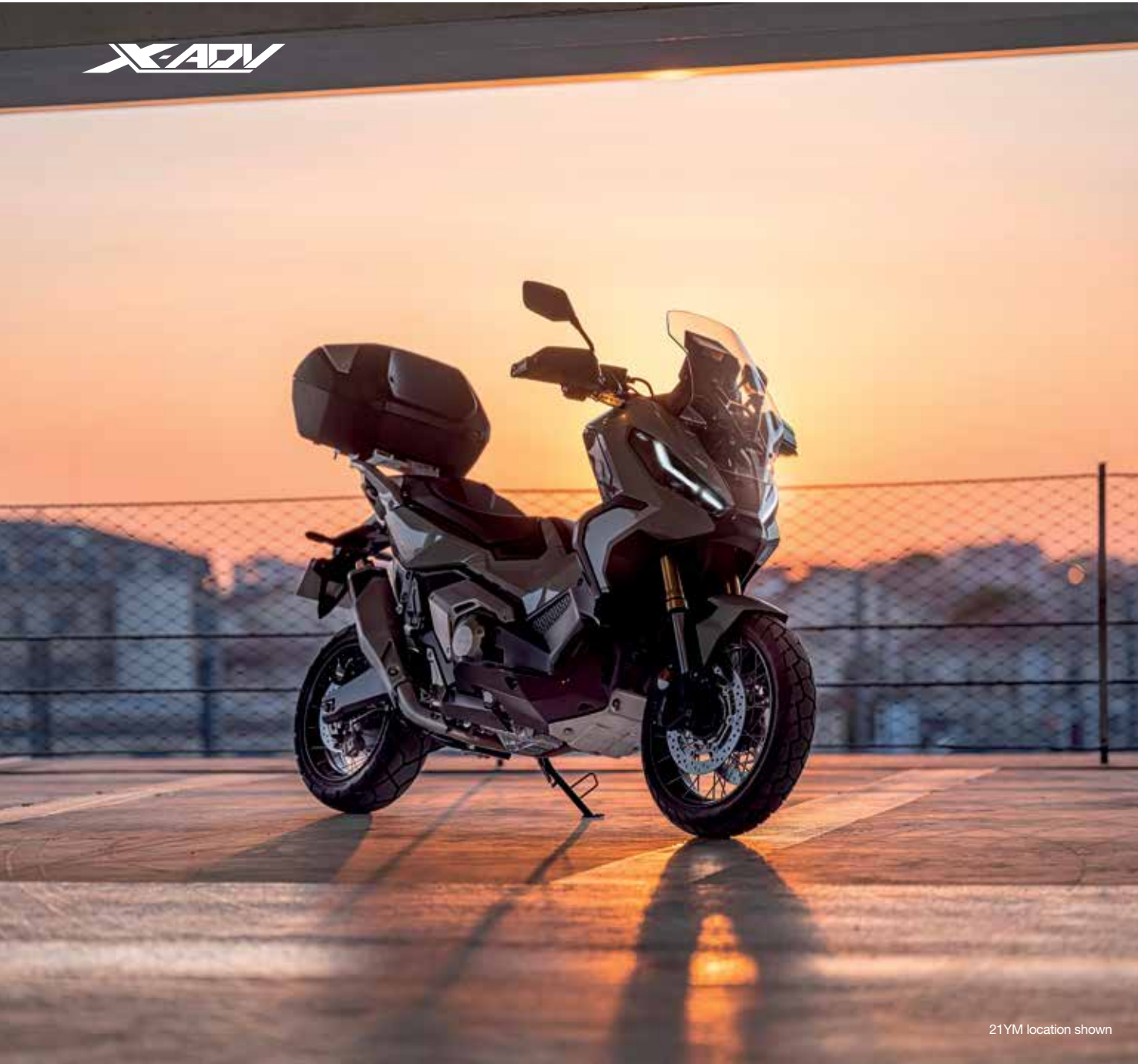
21YM location shown