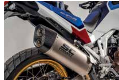
SC-PROJECT ADVENTURE MUFFLER 0R24MLEX008 / 0R24MLEX012

Possibility to order the panniers with stickers already fitted, as shown in picture (Part number: 08MHF-LOD-002GPAN)