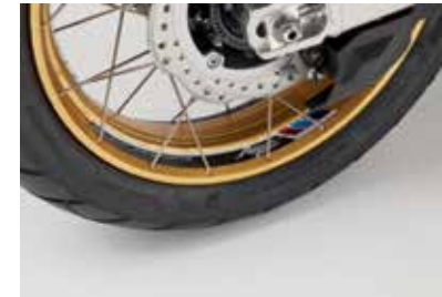
WHEEL STRIPES SET 08F70-MKS-E20ZE / 08F70-MKS-E20ZD

Available in 2 colours to match the different versions of the Adventure Sports, these wheel stripes improve the design and add some protection to the rims. Each set includes 2 pieces for each wheel.