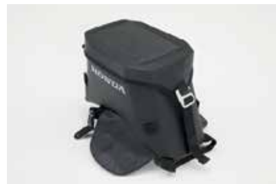
4.5L TANK BAG 08L85-MKS-E00

Black nylon bag with embroidered silver Honda wing logo on the top and red zippers. Comes with adjustable shoulder belt and carrying handle.