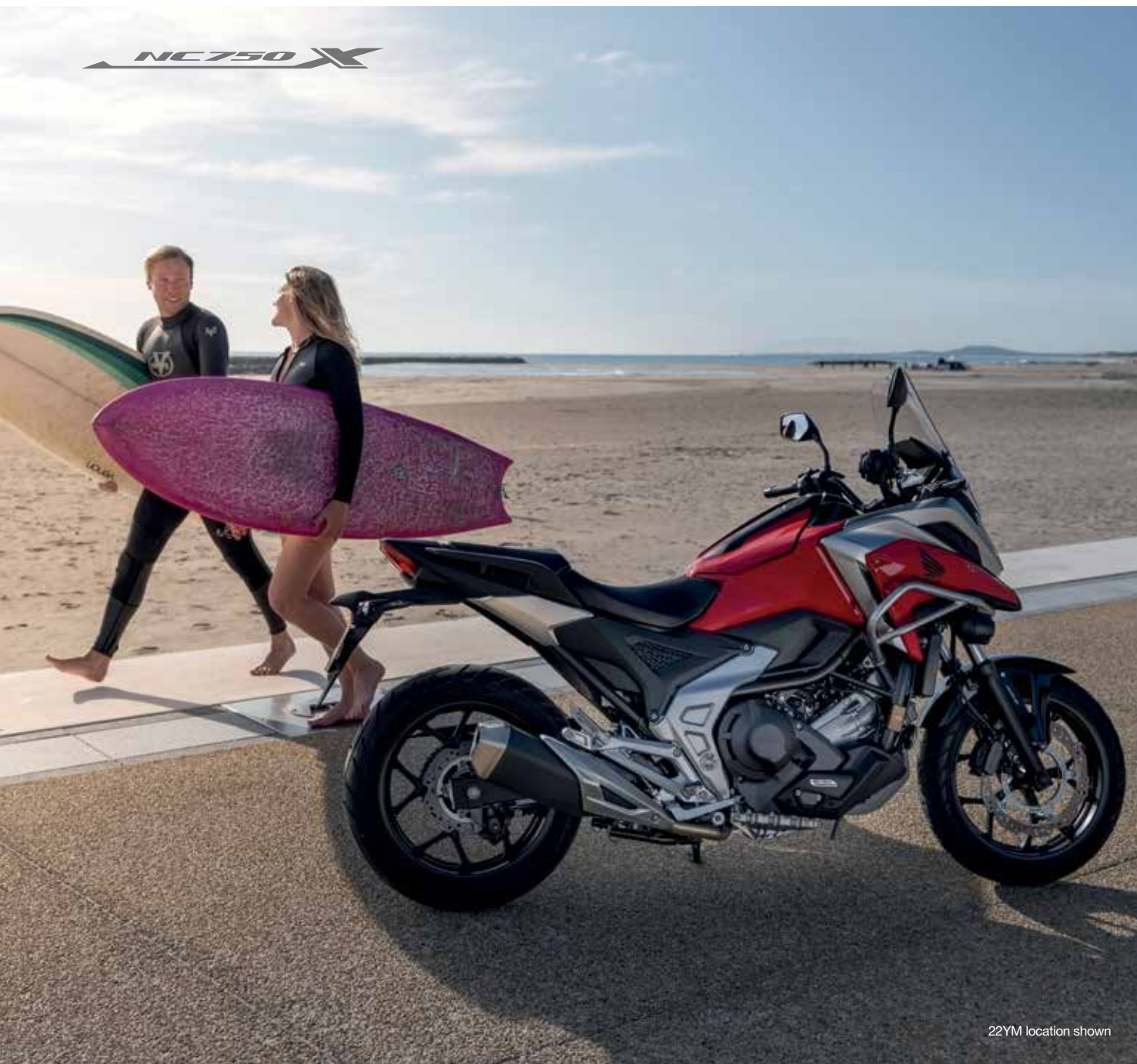
22YM location shown