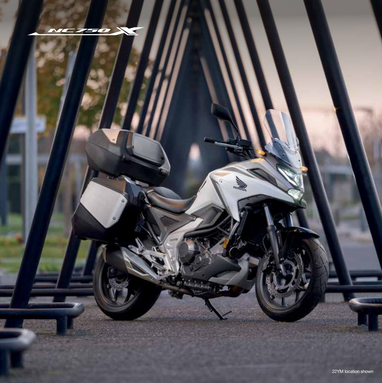
22YM location shown