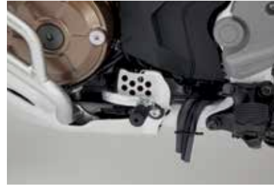
DCT PEDAL SHIFT 08U70-MKS-E50

With their aggressive spike shape and a surface 57% larger than the standard ones, these Rally Steps improve the control during off-road riding.