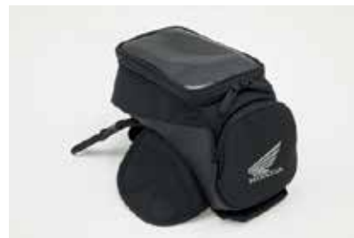
3L TANK BAG 08L89-MKS-E00

This light and compact Tank Bag features a transparent pocket and it's ideal to store small personal items. Unnoticeable while steering the bike, this Tank Bag is firmly attached thanks to a one-touch buckle and a magnet. A rain cover is included.