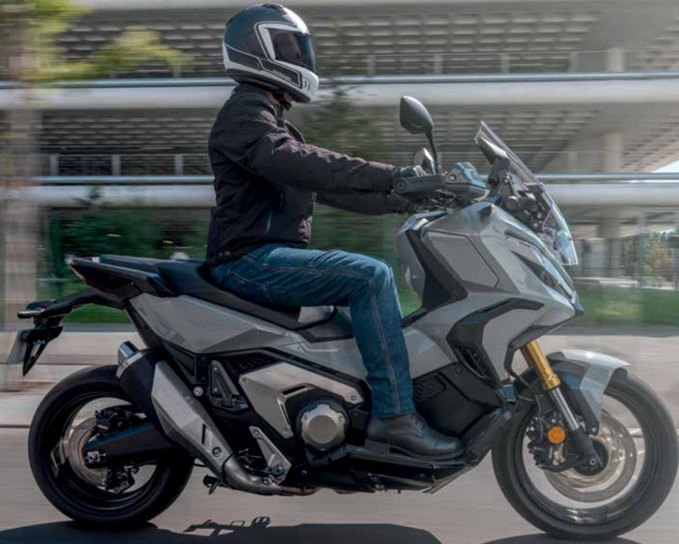
21YM location shown