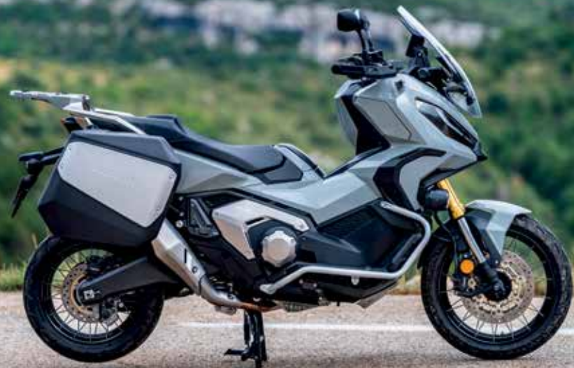
21YM location shown